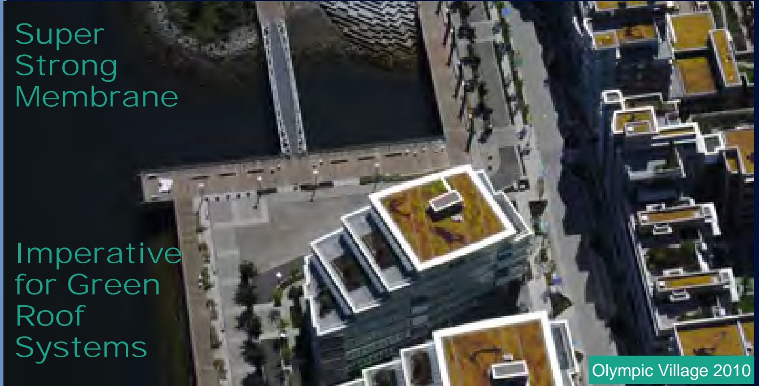
Olympic Village 2010